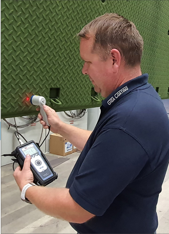
The in-house software is the intelligence of the coating line