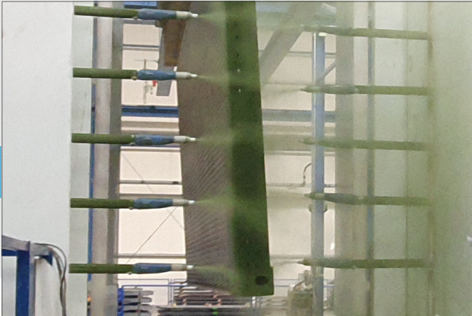
The powder booths are equipped with 16 and 20 automatic guns respectively